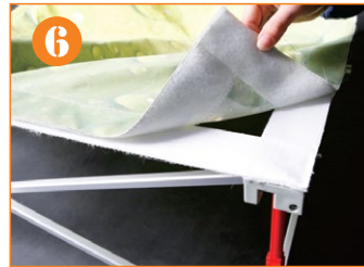
6. Lay the frame on the ground and install the graphic.