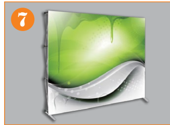
7. Completed Surgir frame with graphic.