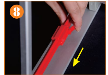
8. Remove the graphic and unfasten the red plastic connectors located at the 4 corners of the frame.