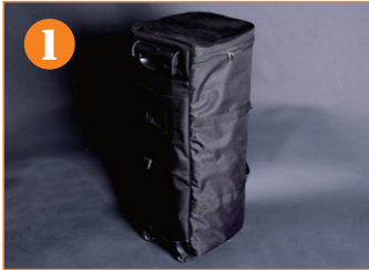
1. Surgir trolley bag.