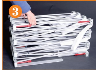
3. Open the frame up