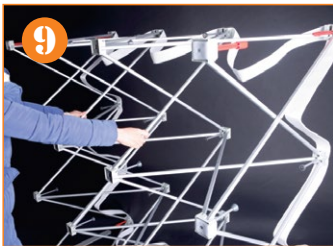
9. Close the frame and put into the trolley bag.