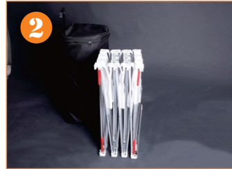
2. Take out the frame from the bag.