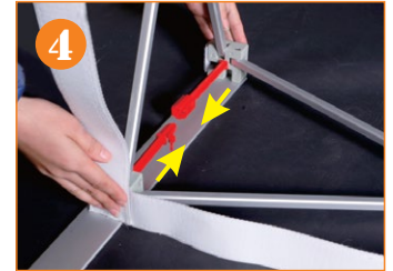
4. Fasten the red plastic connectors located at the 4 corners of the frame.