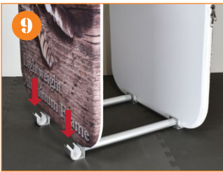
9. Connect the base of the panels using the 2 bottom poles.