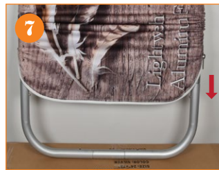
7. Install the pillowcase graphics by sliding in from one side.