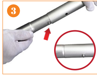
3. Press the snap fastener to connect and lock the tube parts.