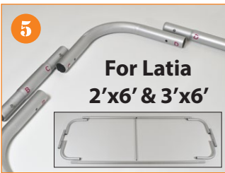
5. Connect 2 bungee corded Strait tubes with the tubes marked A, B, C, D first. Match the same letters on each end.