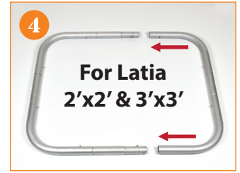
4. For 2x2 and 3x3 Latia, simply connect the L tubes & Straight tubes together.