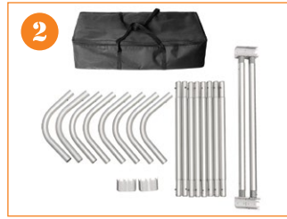
2. Take out the parts of the frame from the bag.