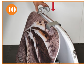
10. Connect the top of the panels using the 2 top connectors.