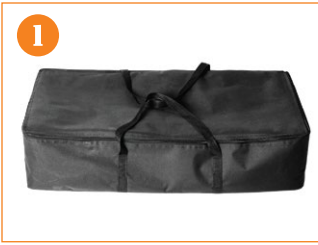
1. Latia back padded bag.