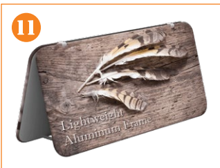
11. Completed Latia.