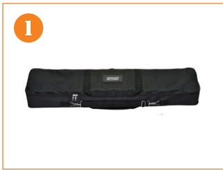
1. Unda black padded bag.