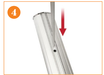
4. Insert the pole into the base.