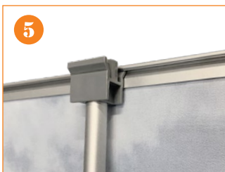
5. Attach one top bar on the top clamp profile.