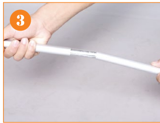
3. Connect the 3 section pole.