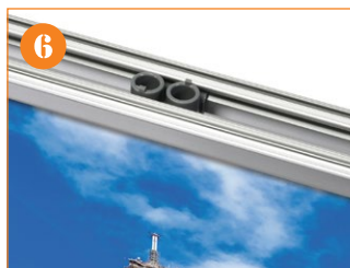
6. Attach the other top bar on the top clamp profile.