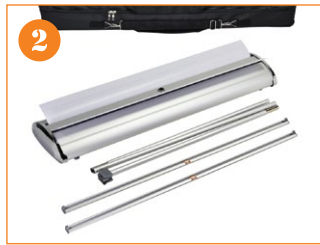
2. Take out the hardware and pole from the bag.