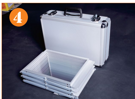
4. Take out the shelf from the case.