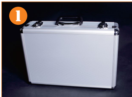
1. Case with stand.