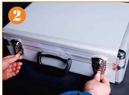
2. Open the case.