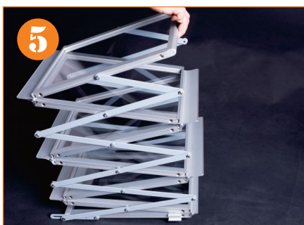
5. Pull up the top part to fully open the shelf.