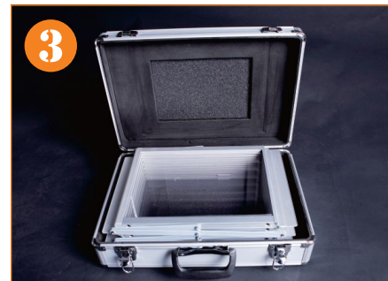
3. Shelf in the case.