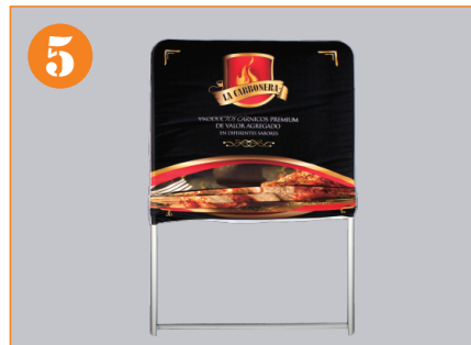
5. To install the graphic, slide the graphic from the top of the frame towards the bottom.