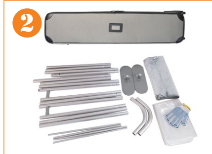
2. Take out the parts of the frame from the case