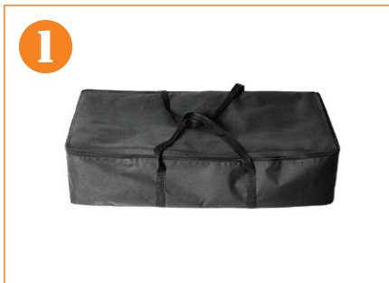
1. Retto E- black padded bag.