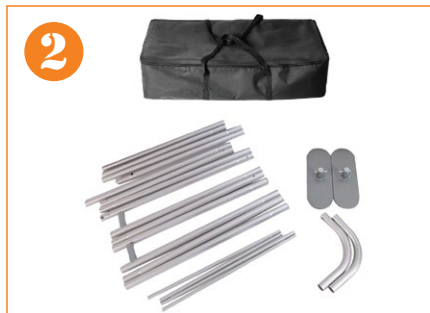
2. Take out the parts of the frame from the bag.