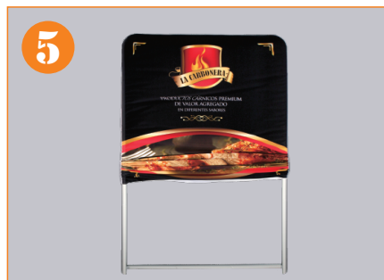
5. To install the graphic, slide the graphic from the top of the frame towards the bottom.