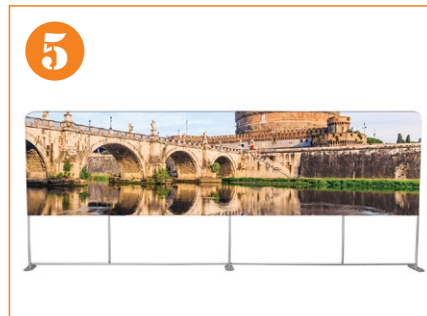
5. To install the graphic, slide the graphic from the top of the frame towards the bottom.