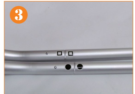
3. Assemble the frame by connecting the tubes with the same mark/shape.