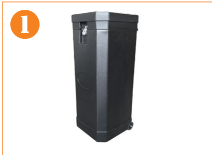
1. Retto 20 large plastic case.