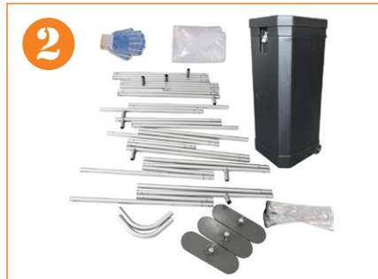
2. Take out the parts of the frame from the case.