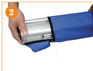
2. Take out the base from the bag