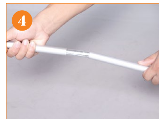
4. Connect the 3 section pole.