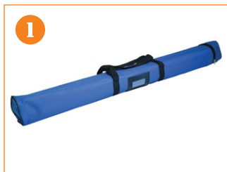
1. Roti carry bag.