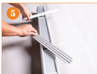
5. Turn both feet sideways to secure the base