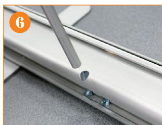
6. Insert the pole into the base.