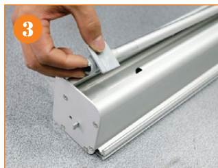
3. Take out the pole from the base.