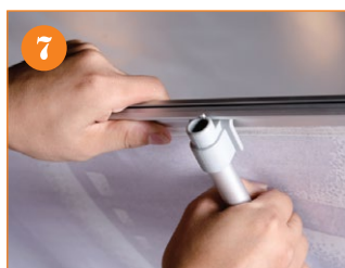
7. Attach the top bar on the top clamp profile.