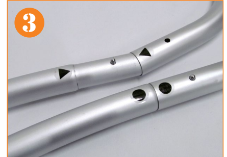
3. Assemble the frame by connecting the tubes with the same mark/shape