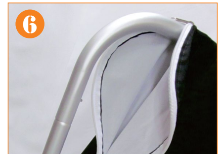
6. Once the frame is fully covered, zip the end of the graphic.