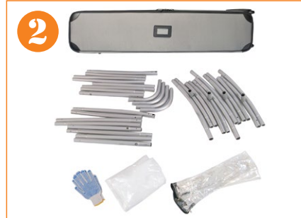
2. Take out the parts of the frame from the case