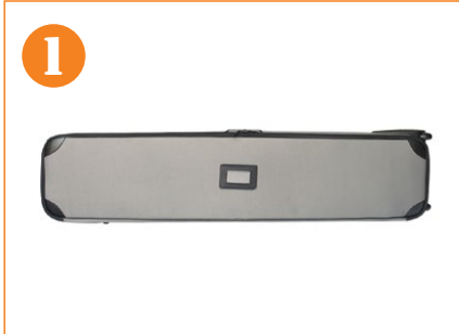
1. Forma gray hard case