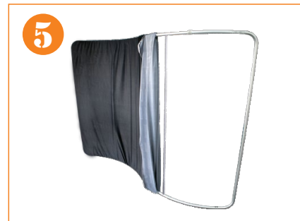
5. To install the graphic, slide the graphic on the frame from left to right until covered.