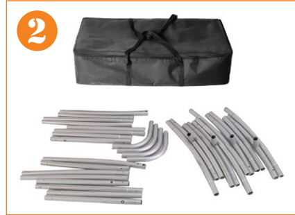
2. Take out the parts of the frame from the case