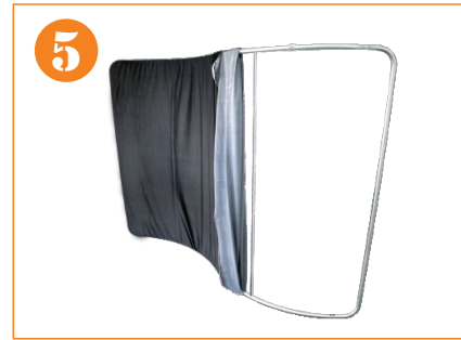
5. To install the graphic, slide the graphic on the frame from left to right until covered.