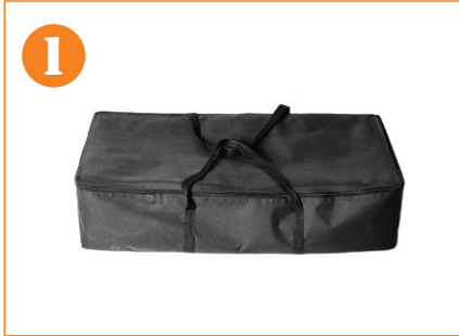
1. Forma-E black padded bag