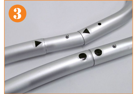
3. Assemble the frame by connecting the tubes with the same mark/shape