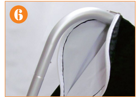
6. Once the frame is fully covered, zip the end of the graphic.