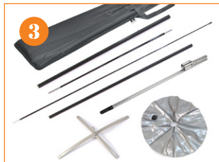
3. Take out the poles and Spike (Outdoor set) or Cross base & Water Filler (Indoor set).