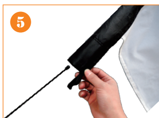
5. Insert the pole into the graphic sleeve.