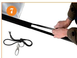
7. Thread the Bungee Cord through the grommet at the bottom of sleeve.