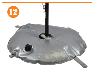
12. Fill base with water to complete the installation.