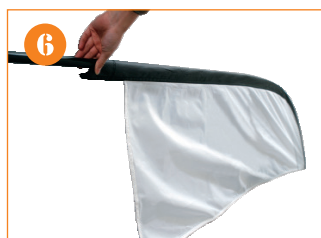
6. Gently pushing the pole all the way to the end.