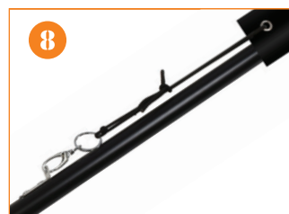
8. Secure the Bungee with the Carabiner Clip (as shown) and connect it to the loop on base pole.