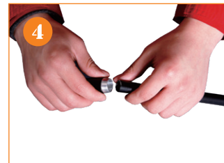
4. Connect the poles one by one.