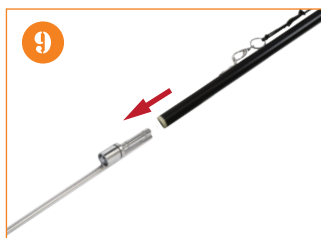
9. Install the pole on the Spike for the outdoor flag.