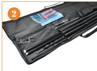
2. Open the bag.