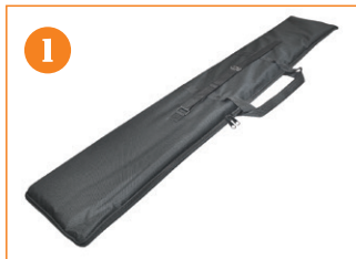
1. Bag with stand.