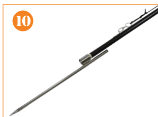
10. Complete the outdoor flag with the Spike Base.