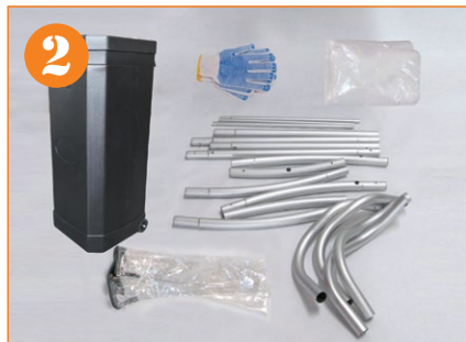
2. Take out the parts of the frame from the bag