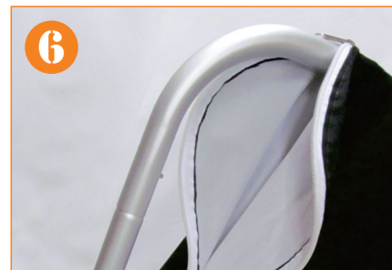
6. Once the frame is fully covered, zip the end of the graphic.