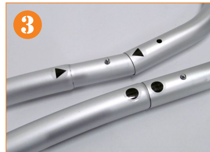
3. Assemble the frame by connecting the tubes with the same mark/shape