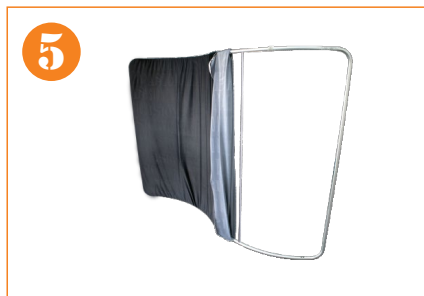
5. To install the graphic, slide the graphic on the frame from left to right until covered.